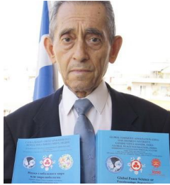
Global Peace Maecenas; €3000