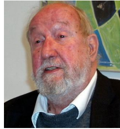
Nobel Peace Prize Laureate; World Harmony Creator