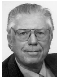
W. Harmony Creator