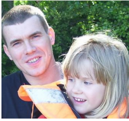
Global Peace Maecenas; $3500