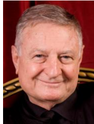
W. Harmony Creator