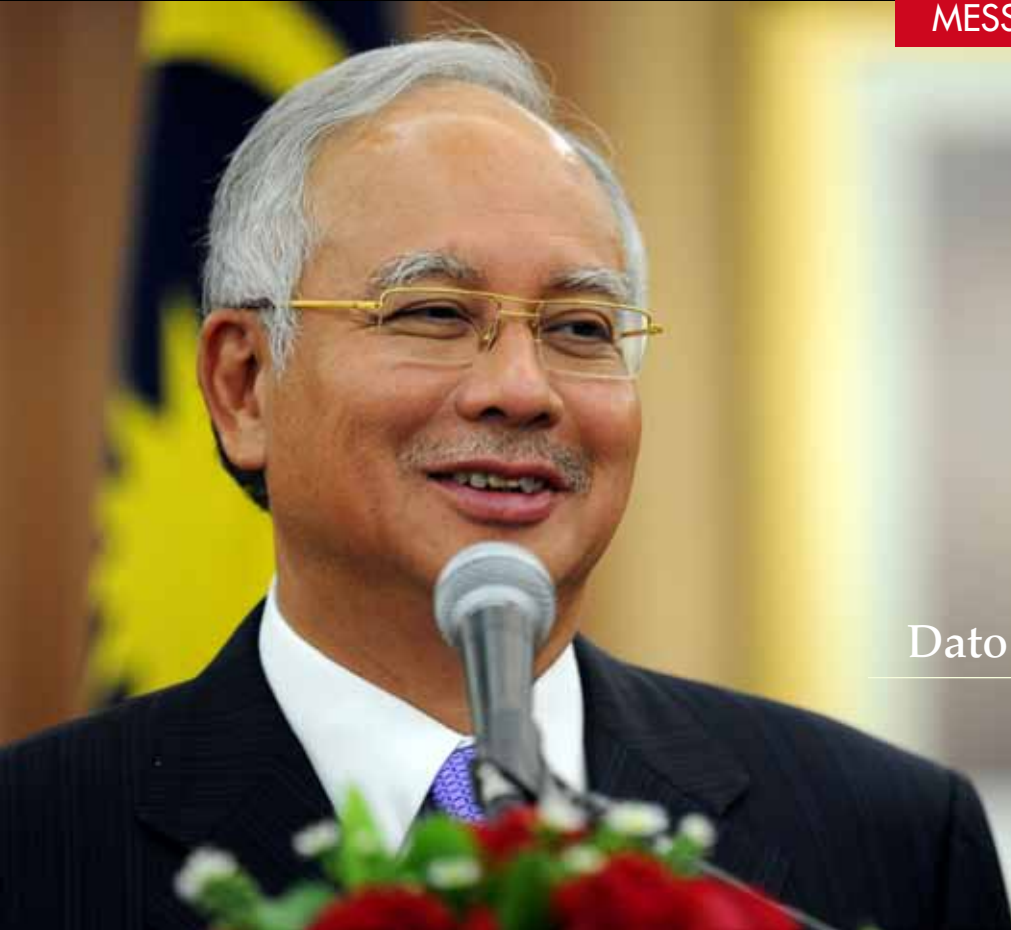
Dato Sri Najib Tun Razak