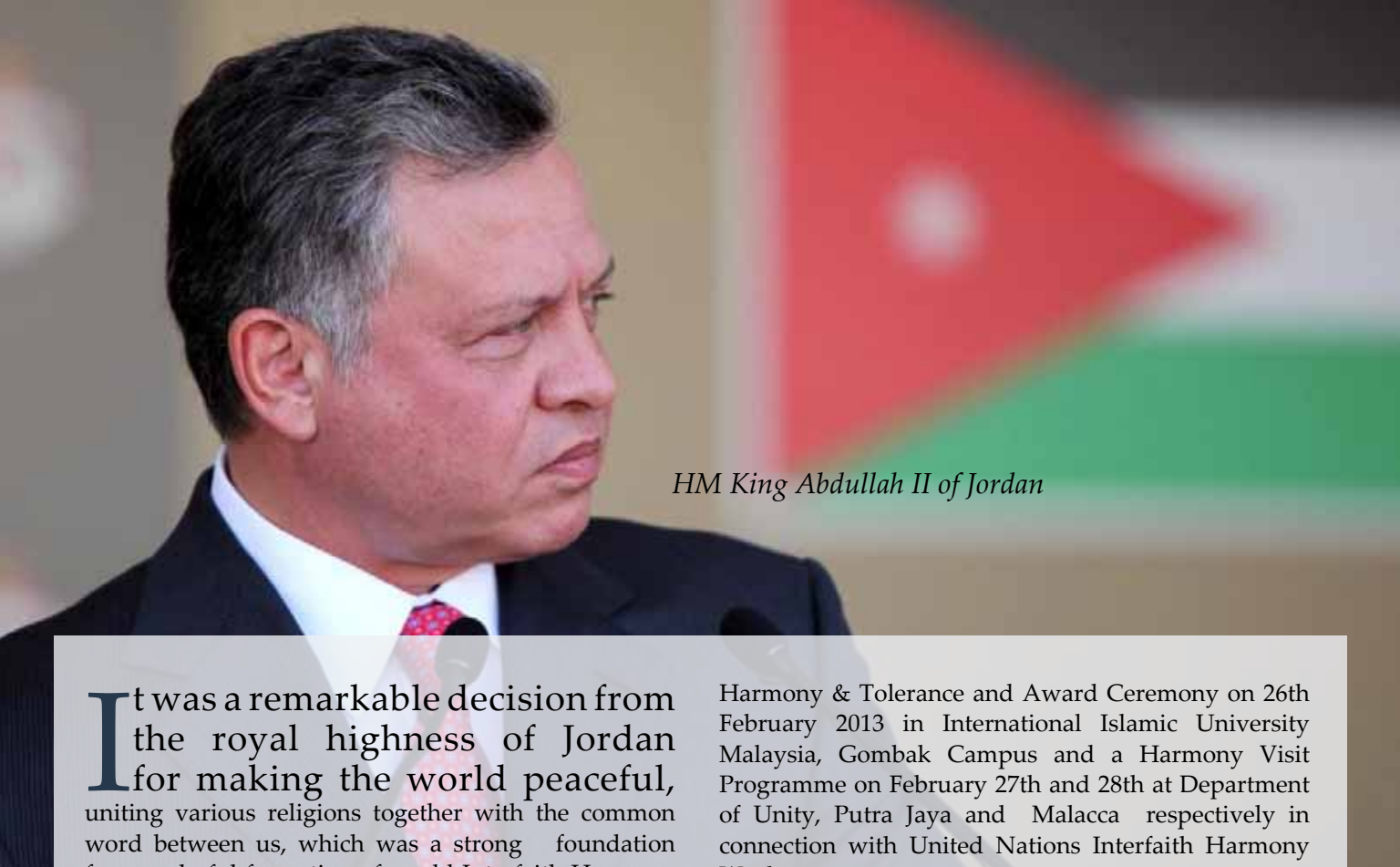
HM King Abdullah II of Jordan

I t was a remarkable decision from the royal highness of Jordan for making the world peaceful, uniting various religions together with the common word between us, which was a strong foundation for wonderful formation of world Interfaith Harmony Week resolution of United Nations. The whole world united together to observe the Week of Harmony and Tolerance, when HM King Abdullah II of Jordan proposed a World Interfaith Harmony Week at the Plenary Session of the 65th UN General Assembly in New York on September 23, 2010. The proposal was adopted unanimously by the UN General Assembly in New York on the grounds that humanity bound together by the two shared commandments of 'Love of God and Love of the Neighbour' or 'Love of the Good and Love of the Neighbour'.